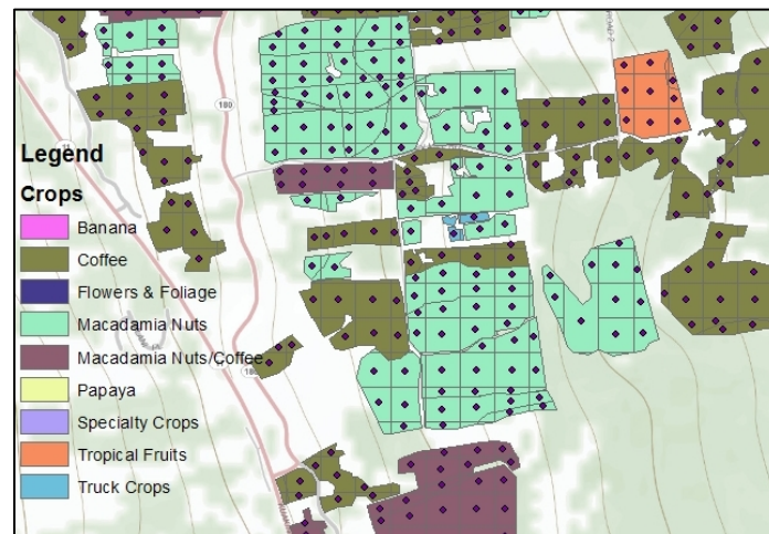
Figure 1- Crop point samples at center of each intersected polygon.

To produce the set of sample points required by the MaxEnt tool, the polygons of the crop data were intersected with the 100m grid framework used for the environmental data (see below) and with the soil map unit polygons. This produced a large number of smaller polygons identified with a single crop type and soil map unit nesting within the cell boundaries of the other environmental data. To reduce the size of the dataset, all intersected polygons with an area smaller than 1000 sq m were removed. Given the number of polygons, this loss of information was considered irrelevant. Finally a point was calculated in the center of each of these remaining polygons (Figure 1). Note that in the legend there is a Macadamia Nuts/Coffee category. Points falling in this category were duplicated in the dataset and retyped once as "Coffee" and once as "Macadamia Nuts".